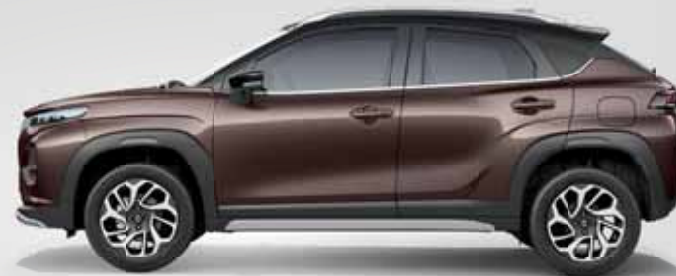
EARTHEN BROWN + BLUISH BLACK