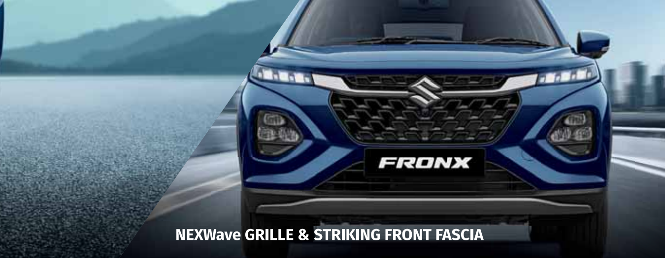
NEXWave GRILLE & STRIKING FRONT FASCIA