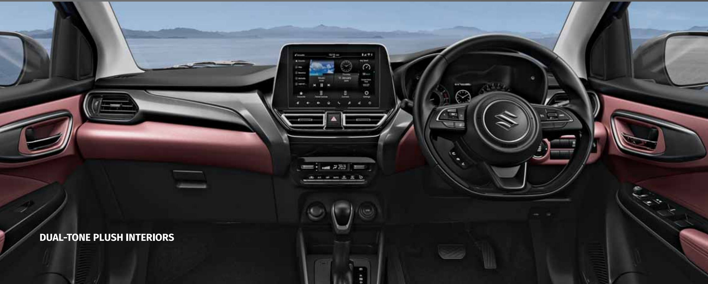
DUAL-TONE PLUSH INTERIORS

From the moment you step in, FRONX enhances the SUV experience with its structural precision and integrated function. The dual-tone dashboard with special forged metal finish and accents seamlessly connects the steering, infotainment system and rounds off the interiors in style. Cruise control and steering-mounted controls ensure you never have to take your hands off the wheel. What amps up the luxury for you, and yours, are details like the driver armrest; rear AC vents; and rear fast charging.