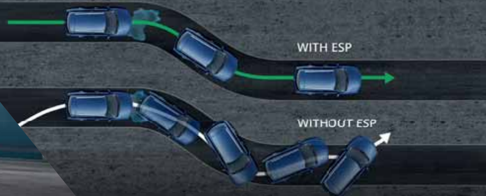
ELECTRONIC STABILITY PROGRAM