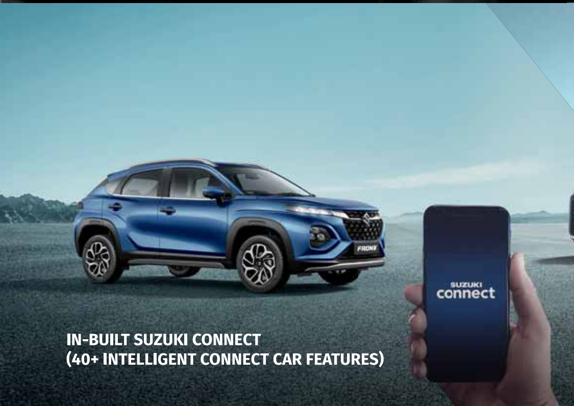
IN-BUILT SUZUKI CONNECT (40+ INTELLIGENT CONNECT CAR FEATURES)