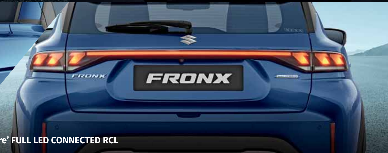
NEXTre' FULL LED CONNECTED RCL