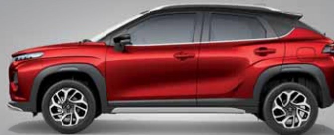
OPULENT RED + BLUISH BLACK