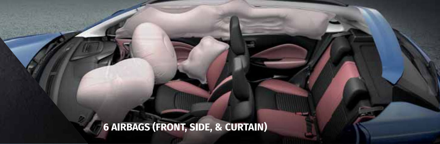
6 AIRBAGS (FRONT, SIDE, & CURTAIN)