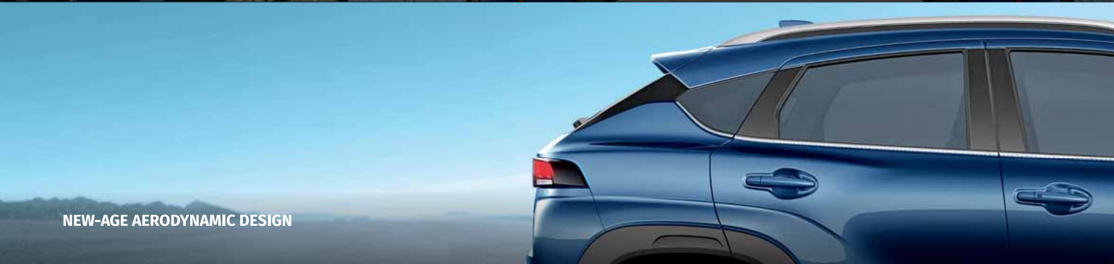
NEW-AGE AERODYNAMIC DESIGN