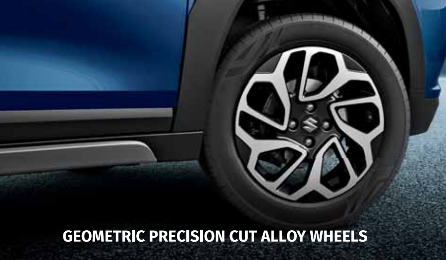
GEOMETRIC PRECISION CUT ALLOY WHEELS