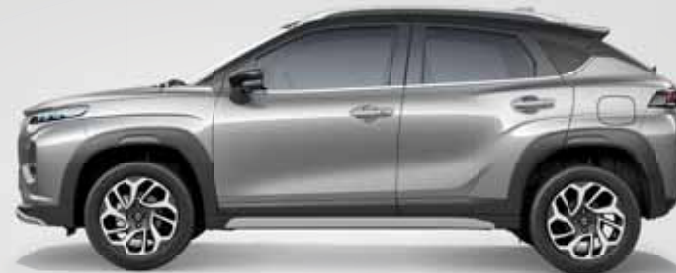
SPLENDID SILVER + BLUISH BLACK