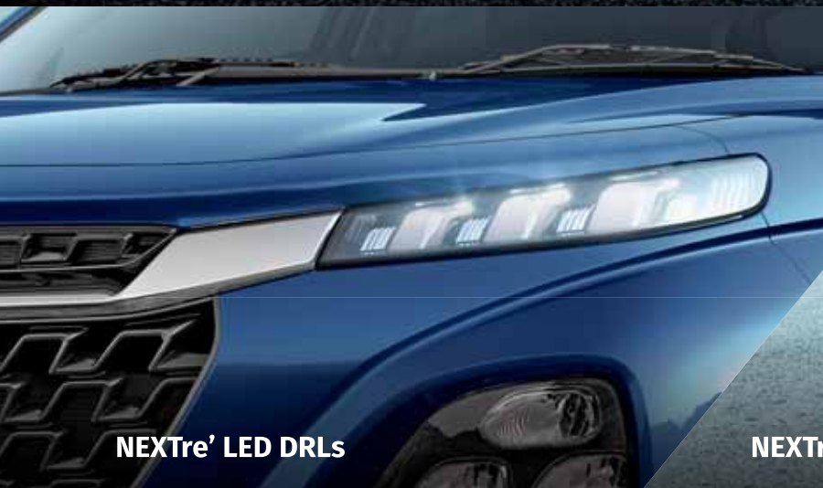
NEXTre' LED DRLs